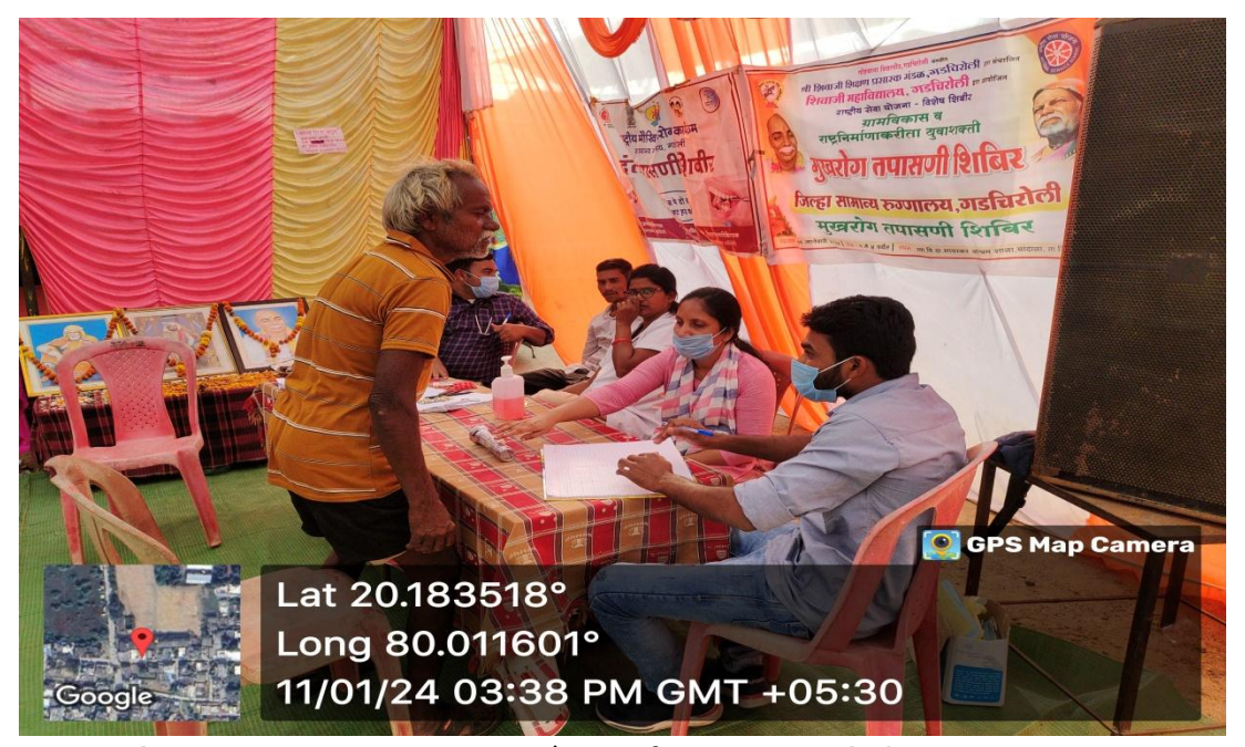
जिल्हा सामान्य रुग्णालय यांचे मार्फत आरोग्य शिबिराचे आयोजन